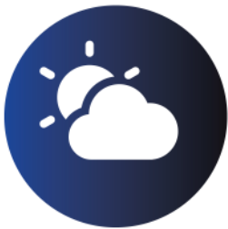
Live Weather Update