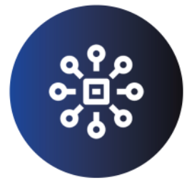
In-house channel Support