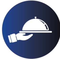
Integrated Dining Webpage